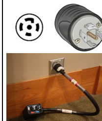
L21-30 w/ quad box

100A 3ph Disconnect in second floor dimmer room w/ 150' 5 wire banded #2 cable