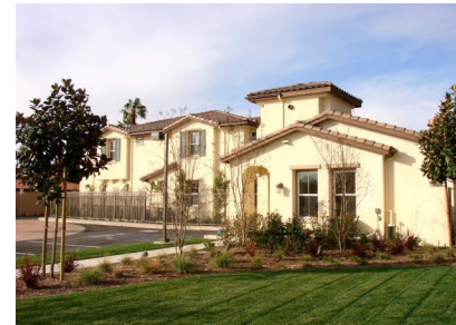
Fountain Walk Opened in 2007