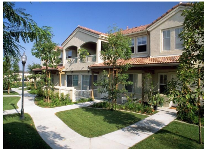
Emerald Villas Opened in 2000