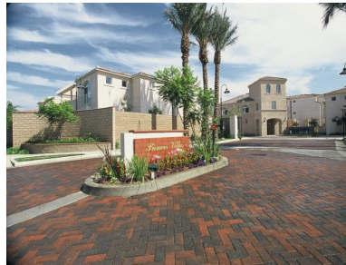
Pioneer Villas Opened in 2001